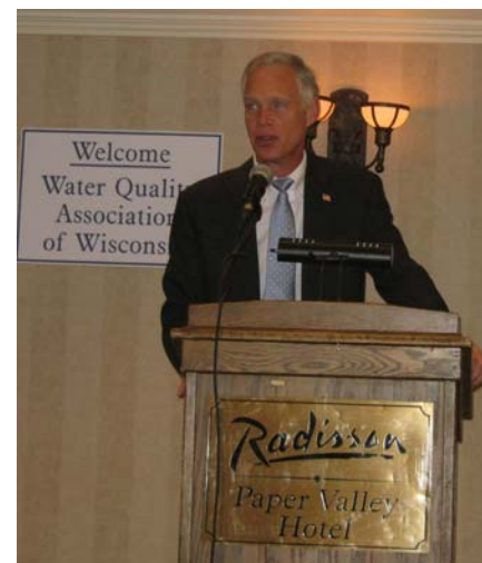
Wisconsin's newest US Senator, Ron Johnson, took time off from the campaign trail to speak to the association.